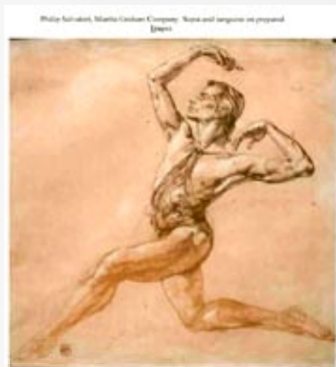
Read article at ARC

teacher and author This article will be helpful for art students and facinating reading for art lovers.