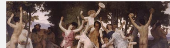
Les Remords d'Oreste, by William Bouguereau