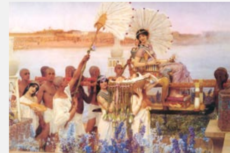
The Finding of Moses by Sir Lawrence Alma Tadema