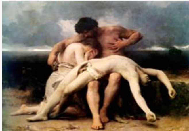
Premier Deuil (The First Mourning) by William Bouguereau

Whether we are talking about the chains of the conceptual,...or the dungeons of